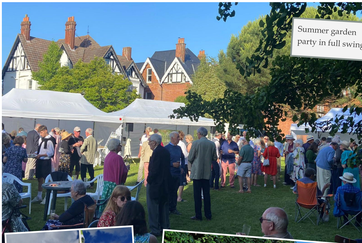
Summer garden party in full swing

See Spring newsletter for further details