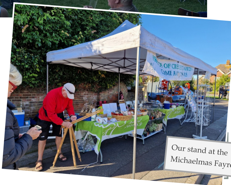
Our stand at the Michaelmas Fayre