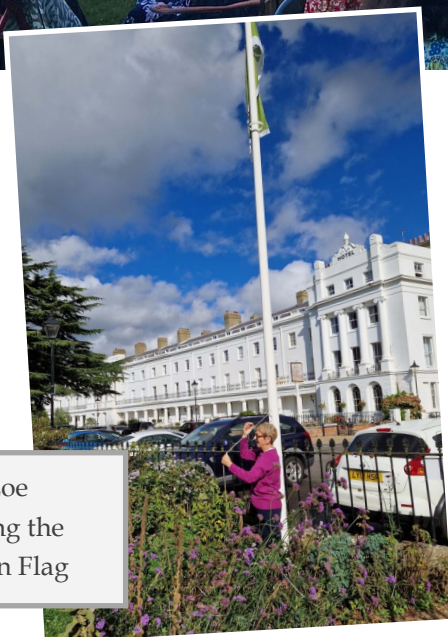
Pat Loe raising the Green Flag